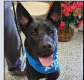
Radar 1 year old male